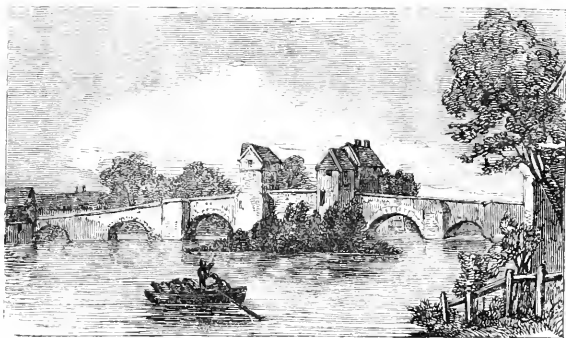
BEDFORD GAOL.—Situated over the middle of the river Ouse, in which John Bunyan wrote the wondrous DREAM. This Prison was pulled down in 1765: the View was taken in 1761.